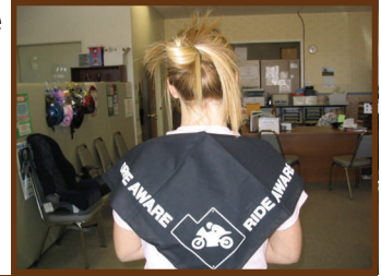
Ride Aware Incentives