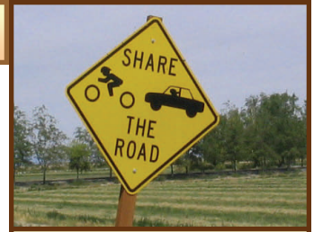
Signage in Millard County

As gas prices soar, the use of motorcycles and bicycles increases. Although they are a cheaper form of transportation they are also much more dangerous. Utah Highway Safety has launched a new "Ride Aware" campaign and Central Utah Public Health Department's injury prevention staff is working hard to increase motorists' awareness of other forms of transportation. Many local counties are also promoting awareness of bicyclists with the new 'Share the Road' signage. These signs are designed to encourage motorists to show courtesy and caution around bicyclists. In 2005, Utah legislators passed a law requiring motorists to maintain a three foot distance from bicyclists. One of our goals is to increase awareness of this law.